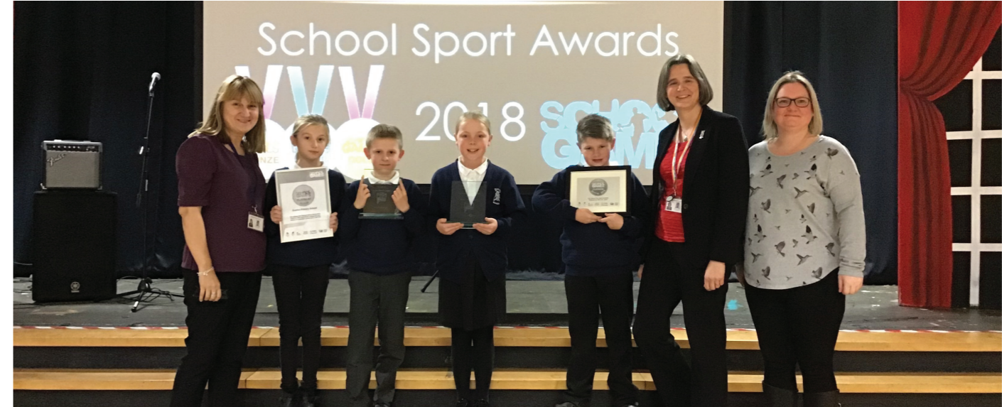
Eastlea proudly accepted 3 awards at the Sports partnership Awards ceremony

SPORT AT EASTLEA has a very high profile and this was celebrated when they proudly accepted 3 awards at the Cramlington and Seaton Valley Sports Partnership Awards Evening.