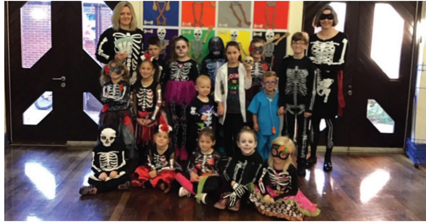
Staff and children enjoying the launch of the Human Body Reading Challenge

READING FOR PUPILS AT EASTLEA is fundamental to their education. All children attending the school realise how important it is and are passionate about improving their reading.